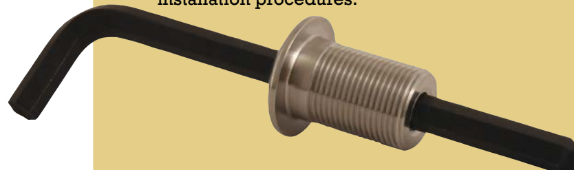
Receiver with Allen wrench

The Phender Pro™ “retrofit kit” makes installation on existing boats a cinch. We provide the tools and hardware you’ll need to quickly install Phender Pro™ in those “impossible to reach” places. See www.phenderpro.com for detailed installation procedures.